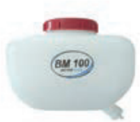
1. Solution Tank