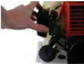
4. Return the starter without letting go