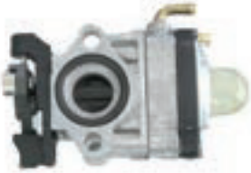
3. Choke Knob