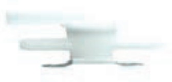
17. Chemical Hose Valve