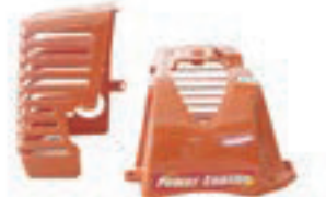
8. Motor Cover