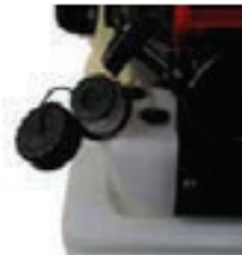
1. Remove fuel cap

After fueling, tighten the fuel cap as securely as possible by hand.