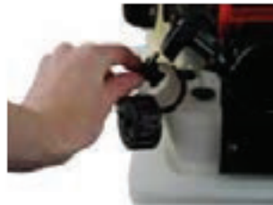
2. Remove fuel filter