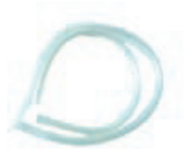
20. Chemical Hose