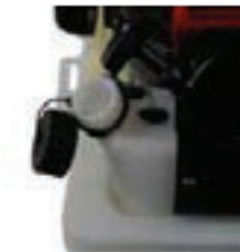
3. Fill with fuel