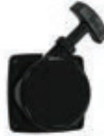
4. Starter Grip