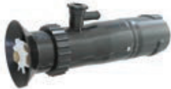
13. Mist Spray Nozzle Assembly