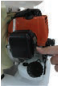
1. Position the choke knob half way

Continue to pull back the starter grip until it begins to operate. Then slide down the choke knob to the open position slowly. Switch the handle grip to the on position. To stop the engine, slide the switch to the off position on the handle grip gun.