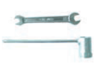
19. Assembly Tool