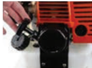
5. After the engine has started, slide the choke knob down slowly to the opened position