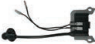
11. Ignition Coil