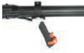
2. Slide switch to ON position