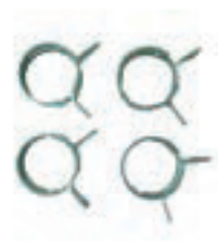
22. Hose Clip