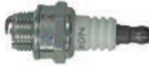
2. Spark Plug