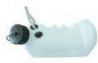
5. Fuel Tank