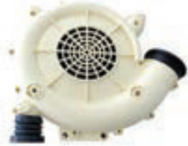
12. Blow Fan