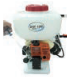
3. Quickly pull the starter until the engine is running