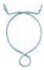
21. Pipe Clip