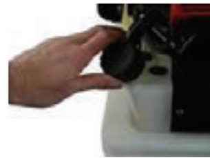
4. Replace filter and cap