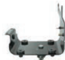
6. Fuel Tank Plate