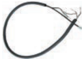
16. Throttle Cable