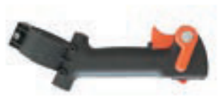
18. Handle Grip Assembly